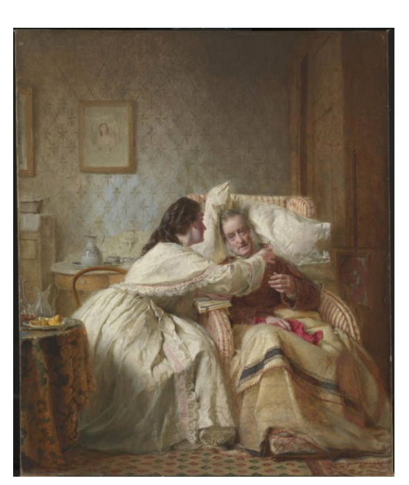
Figure 3: G.E. Hicks, Woman's Mission: Comfort of Old Age, oil on panel, Dunedin Public Art Gallery, 1863