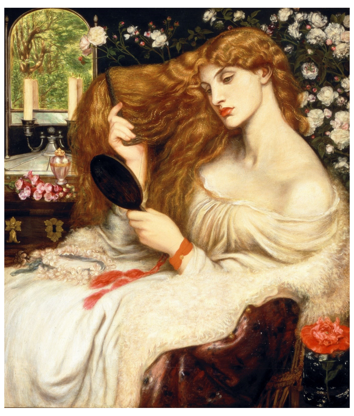
Figure 8: D.G. Rossetti, Lady Lilith, oil, Bancroft Collection, Wilmington Society of Fine Arts, Delaware, 1868