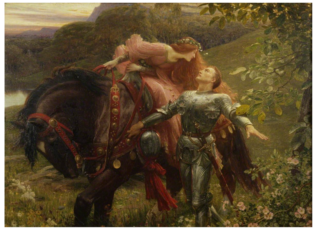
Figure 7: F. Dicksee, La Belle Dame Sans Merci, oil on canvas, Bristol Museum, 1902