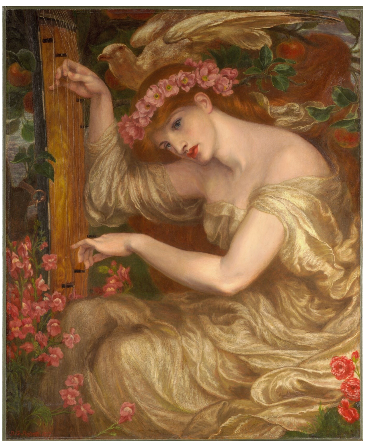
Figure 9: D.G. Rossetti, A Sea-Spell, oil paint on canvas, Harvard Art Museums, Cambridge, Massachusetts, 1877