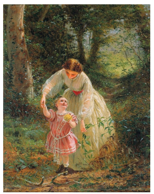
Figure 1: G.E. Hicks, Woman's Mission: Guide to Childhood, oil on panel, Dunedin Public Art Gallery, 1863