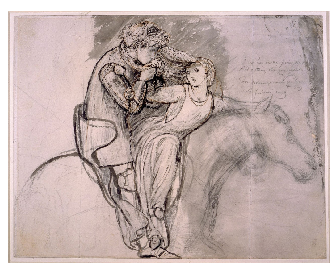
Figure 4: D.G. Rossetti, La Belle Dame Sans Merci, pencil, pen, and wash, British Museum, 1855