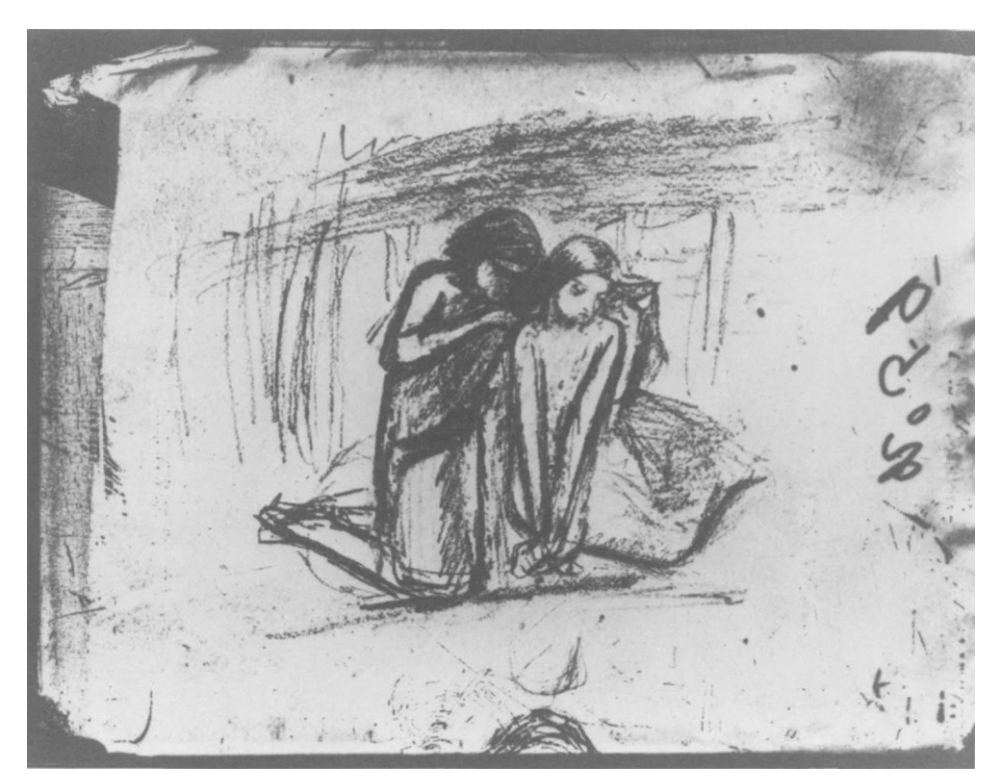
Figure 5: E. Siddal, La Belle Dame Sans Merci, graphite pencil on paper, Ashmolean Museum, Oxford, England, c. 1855