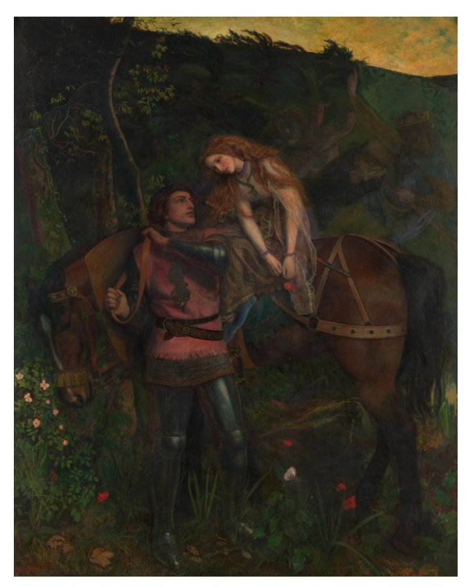
Figure 6: A. Hughes, La Belle Dame Sans Merci, oil on canvas, National Gallery of Victoria, Melbourne, 1863