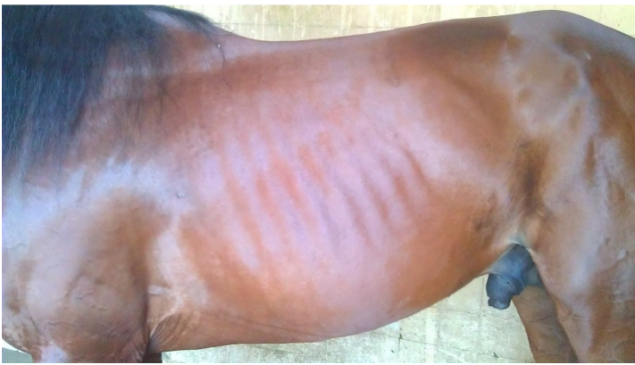
Score 2: shiny coat and soft to the touch

With the passage of time it has been observed that the feed supplement, Grigi-Cereali was not suitable for our horses, subjected almost daily to a hard workout on the track in preparation for the trotting races. It was agreed at the rate of feed and feed supplement we opted for the Purina Horse Starr, with the following composition: wheat bran, soybean hulls (from genetically modified soya), corn (from genetically modified maize), dried sugar beet pulp, rice husk, cane molasses and sugar beet, soybean oil (from genetically modified soya), extruded linseed, calcium carbonate from minced limestone rocks, sodium chloride, dicalcium phosphate (from inorganic sources), corn gluten, inactivated dried yeast.