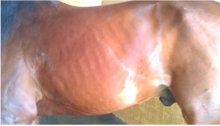
Score 2: shiny coat and soft to the touch