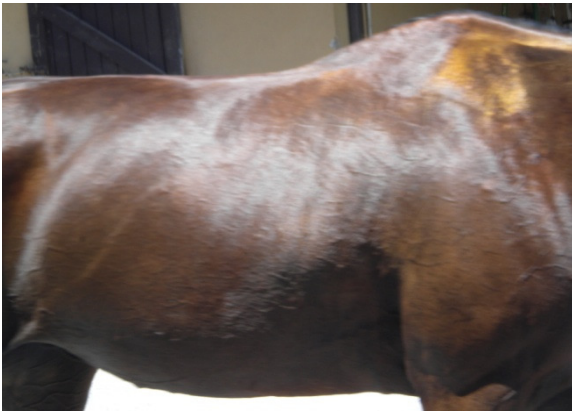
Score 3: very shiny coat and very soft to the touch

The coat of each of them is improved with the passage of time, becoming shiny and silky. The score is increased in some specimens reaching a score of 3.